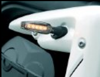
ALLOY LED INDICATORS

STREET TRIPLE. SPOILT FOR CHOICE, FOR PRACTICALITY, FOR HANDLING, FOR PERFORMANCE AND FOR LOOKS. SO GO ON, SPOIL YOURSELF.