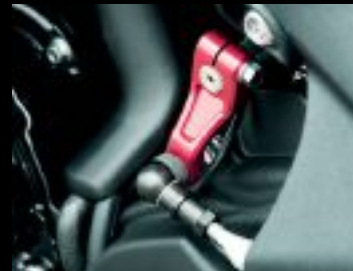
MACHINED GEAR ACTUATOR

Precision machined from acetal for durability and featuring turned aluminium compression limiters with machined Triumph branding around outer rim. Also pictured are CNC Machined Chain Adjuster blocks offered in either red of black anodising, manufactured from 6061 T6 alloy.