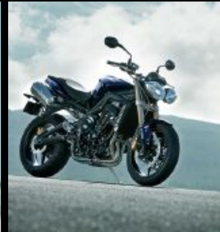
STREET TRIPLE p20 The middleweight streetfighter.