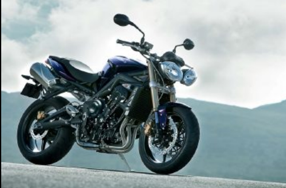
STREET TRIPLE IMPERIAL PURPLE