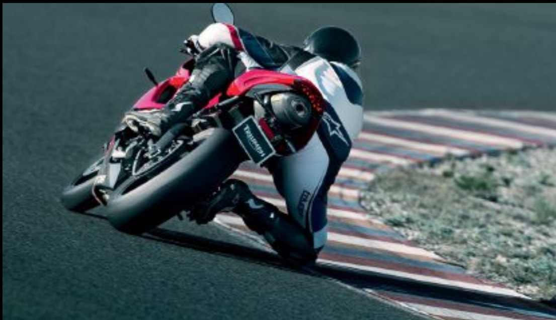
DAYTONA 675 DIABLO RED WITH ACCESSORIES