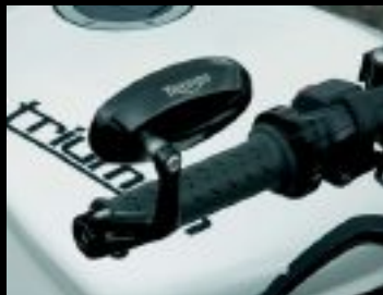
ALLOY BAR END MIRROR

Add even more style with this alloy bodied indicator with high gloss black finish and subtle Triumph branding. E mark approved, fits all Triumph Supersports models. (Requires relay kit)