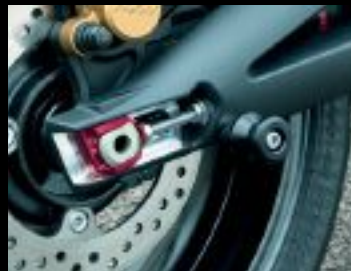
NYLON PADDOCK STAND BOBBINS & MACHINED CHAIN ADJUSTER

Sold individually, this is a stylish alternative to the standard equipment. Manufactured from aluminium and available in a clear or black anodised finish. Features laser etched Triumph logo detailing with tinted mirror glass.