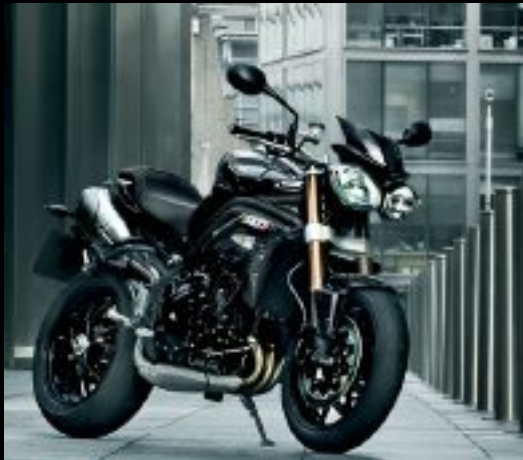
SPEED TRIPLE p6 The original Streetfighter.