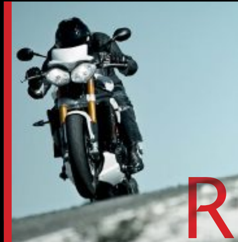
SPEED TRIPLE R p10

Speed Triple up-rated, sharpened and honed to 'R' grade.